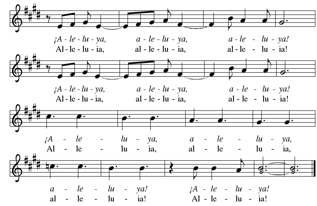
*GOSPEL READING: Matthew 13:24-30, 36-43 The holy gospel according to Matthew. Glory to you, O Lord.

<sup>24</sup>[Jesus] put before [the crowds] another parable: "The kingdom of heaven may be compared to someone who sowed good seed in his field;<sup>25</sup>but while everybody was asleep, an enemy came and sowed weeds among the wheat, and then went away. <sup>26</sup>So when the plants came up and bore grain, then the weeds appeared as well. <sup>27</sup>And the slaves of the householder came and said to him, 'Master, did you not sow good seed in your field? Where, then, did these weeds come from?' <sup>28</sup>He answered, 'An enemy has done this.' The slaves said to him, 'Then do you want us to go and gather them?' <sup>29</sup>But he replied, 'No; for in gathering the weeds you would uproot the wheat along with them. <sup>30</sup>Let both of them grow together until the harvest; and at harvest time I will tell the reapers, Collect the weeds first and bind them in bundles to be burned, but gather the wheat into my barn.'"